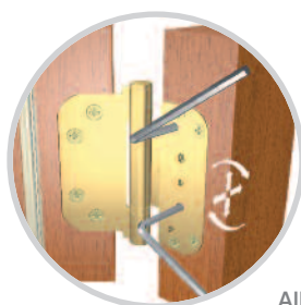
Allen Key Adjustment