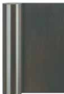
Imitation Bronze Antique