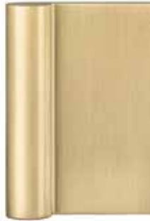
Satin Brass Lacquered